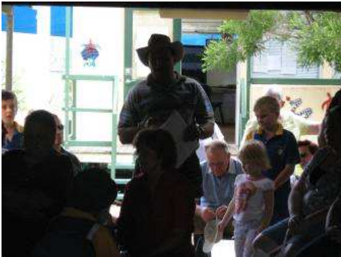
The Grandparents were asked to Reminisce about the days when they were at school and the past in general.