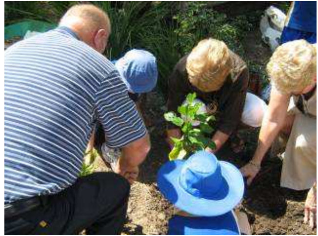
Planting the trees in our Grandparents Garden.