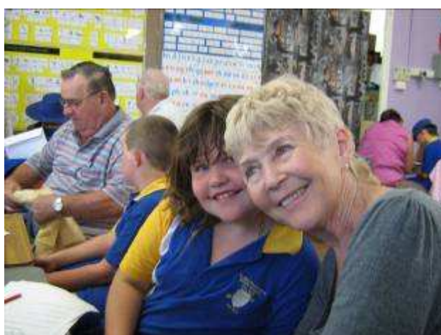
Spending time with our Grandparents in our classrooms.