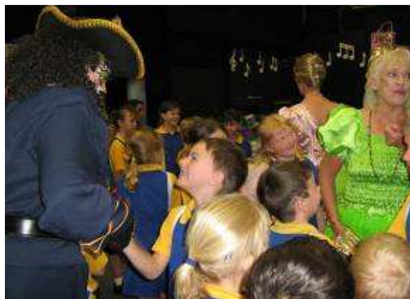
We had a very enjoyable time on our Theatre excursion – and got to meet the Story Land characters!